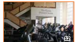
1. Sojka Pavilion (M/W basketball); 2. Kinney Natatorium (M/W swimming & diving, M/W water polo); 3. Davis Gym (volleyball, wrestling); 4. Gerhard Fieldhouse (M/W indoor track & field); 5. Emmitt Field at Holmes Stadium (M/W soccer); 6. Christy Mathewson-Memorial Stadium (football, M lacrosse, outdoor track & field); 7. Fieldhouse Courts (M/W Tennis); 8. Becker Field (softball); 9. Depew Field (baseball); 10. Bison River Complex (rowing); 11. Bachman Golf Center; 12. Krebs Fitness Center.