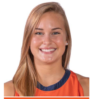
12 MARLY WALLS FR. - G - 5-8