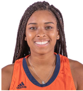
2 KYI ENGLISH SR. - G - 5-5