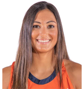
24 AUTUMN CEPPI SO. - F - 6-1