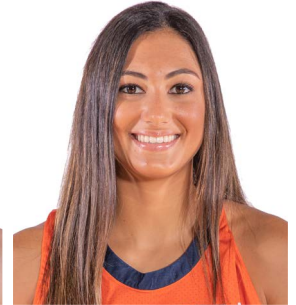
24 AUTUMN CEPPI SO. - F - 6-1