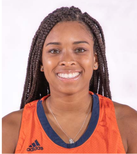
2 KYI ENGLISH SR. - G - 5-5