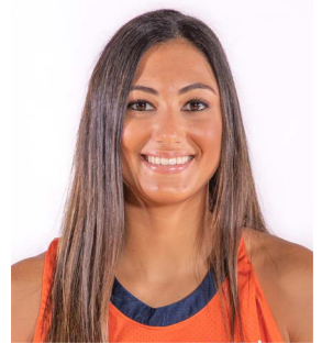
24 AUTUMN CEPPI SO. - F - 6-1