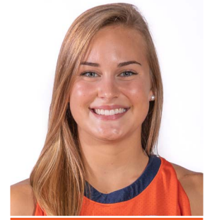
12 MARLY WALLS FR. - G - 5-8